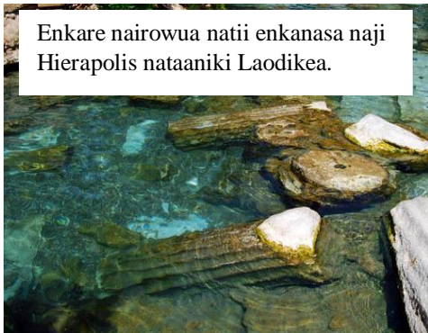
Enkare nairowua natii enkanasa naji Hierapolis nataaniki Laodikea.