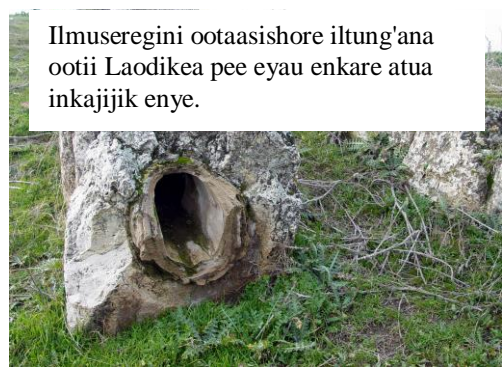
Ilmuseregini ootaasishore iltung'ana ootii Laodikea pee eyau enkare atua inkajjik enye.